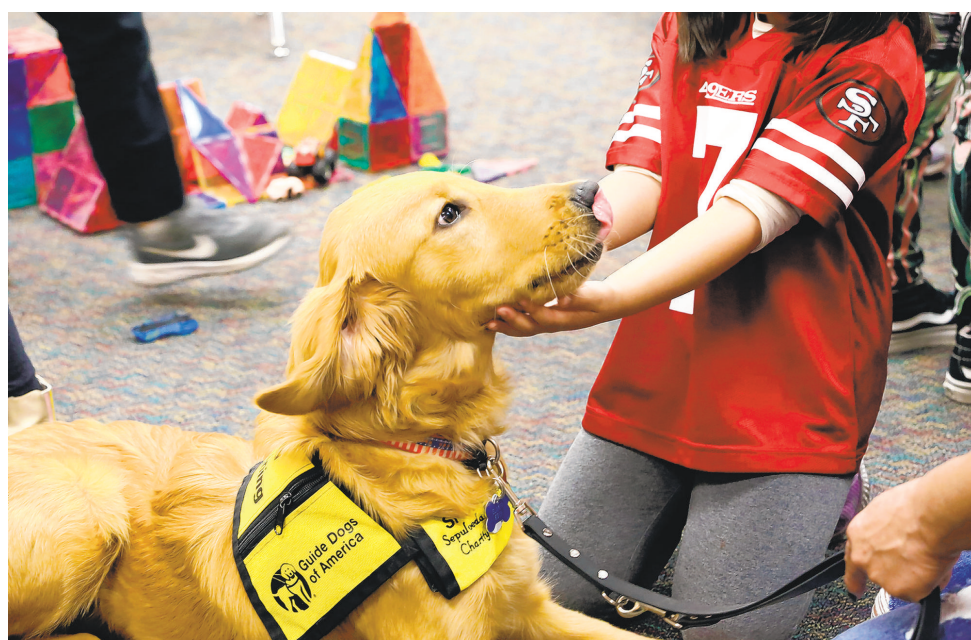
HOPE VIEW Elementary School students learn how to properly pet a service dog during the Ocean View School District campus' annual Service Dog Day on Wednesday.