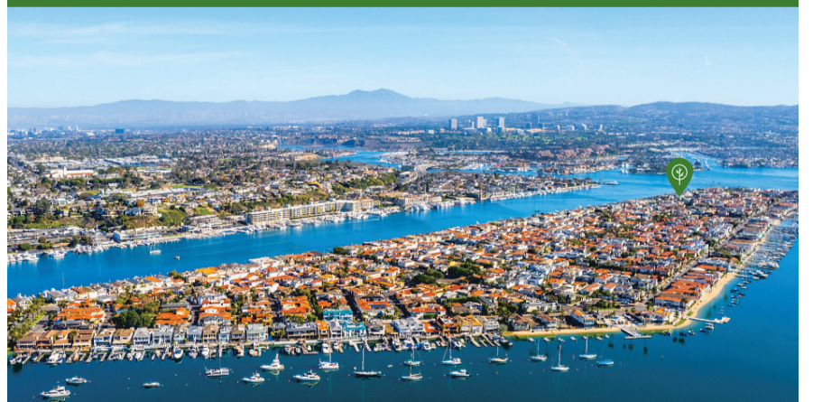
817 Via Lido Nord, Lido Isle List Price $3,445,000