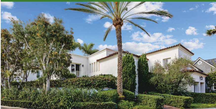
908 Zurich Cir, Lido Isle List Price $6,295,000