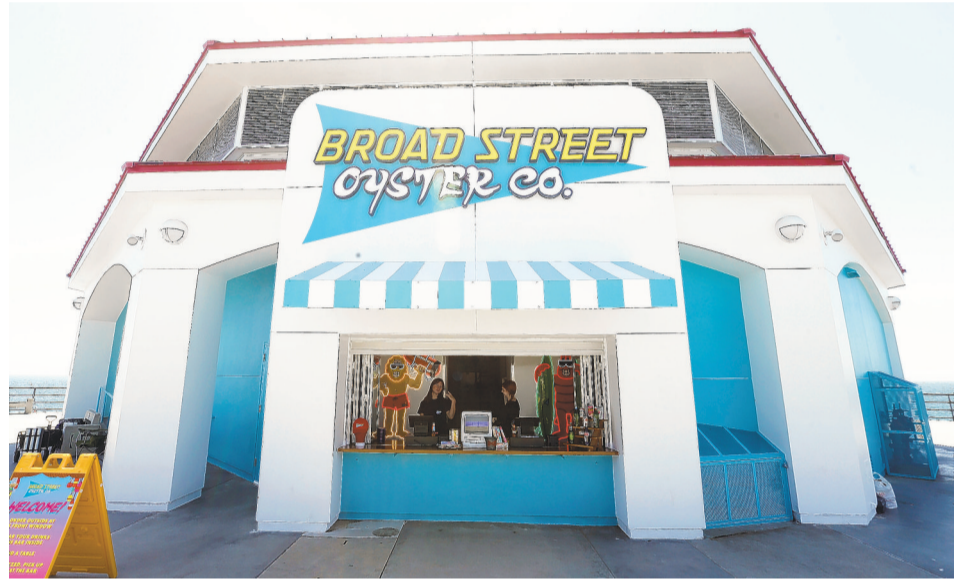
BROAD STREET Oyster Co. retains the red roof of the former Ruby's Diner.