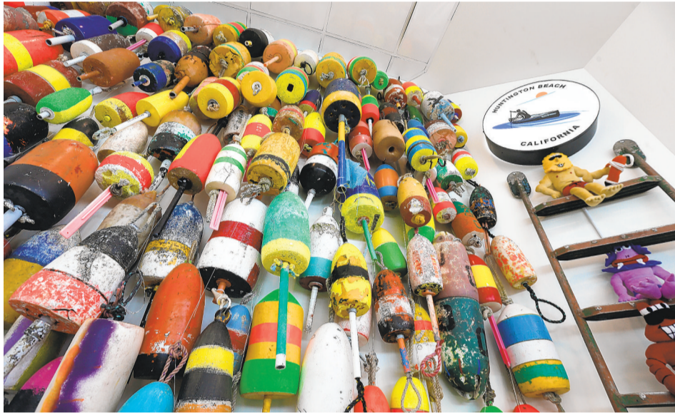
CRAB AND lobster trap buoys decorate the wall of the dining room.