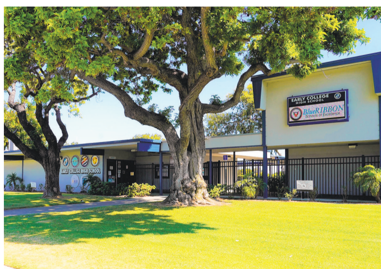
COSTA MESA'S Early College High School on Tuesday was named a 2023 Blue Ribbon School by the U.S. Department of Education.