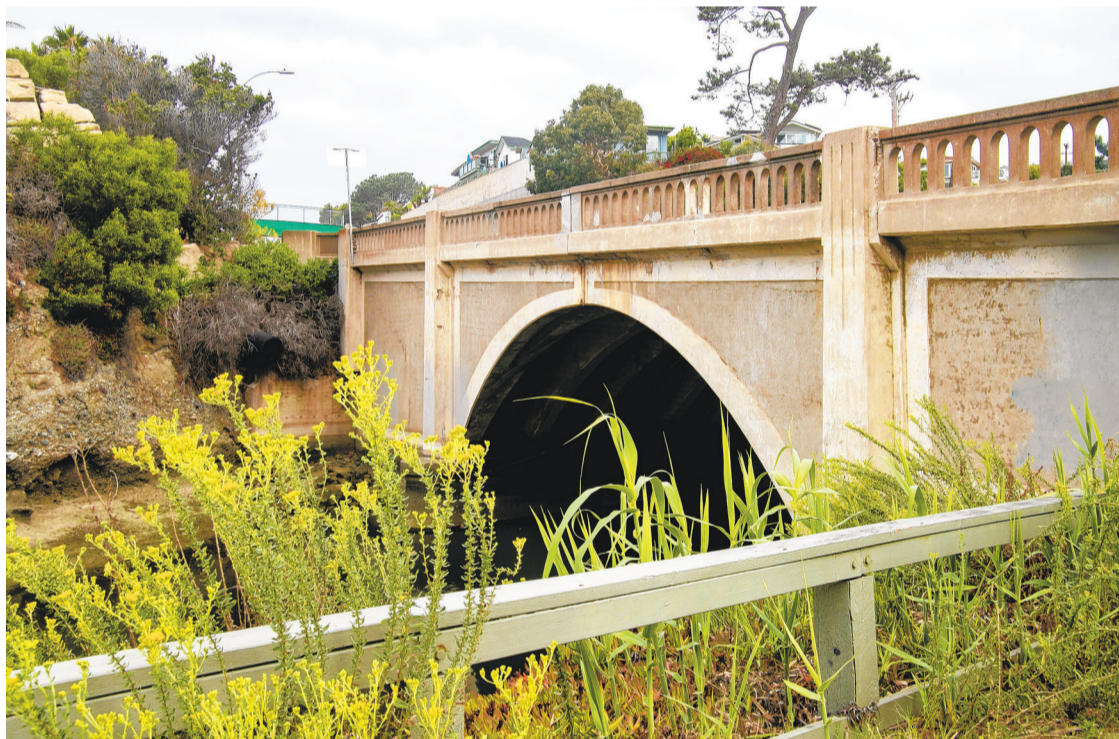
ALISO CREEK Bridge, now renamed Officer Jon Coutchie Memorial Bridge.

The Laguna Beach honor guard presented the colors, making their way down the