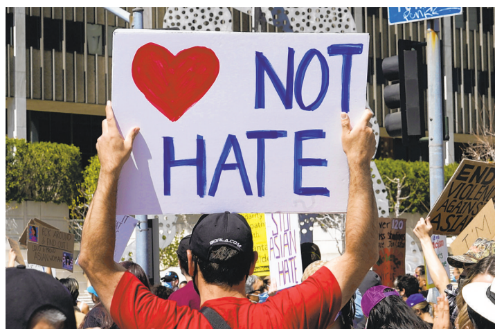
A REPORT ISSUED Thursday by the OC Human Relations commission found a 67% increase in hate crimes in 2022 over the previous year, while hate incidents – which fall short of crimes – dropped by a slight 4%.