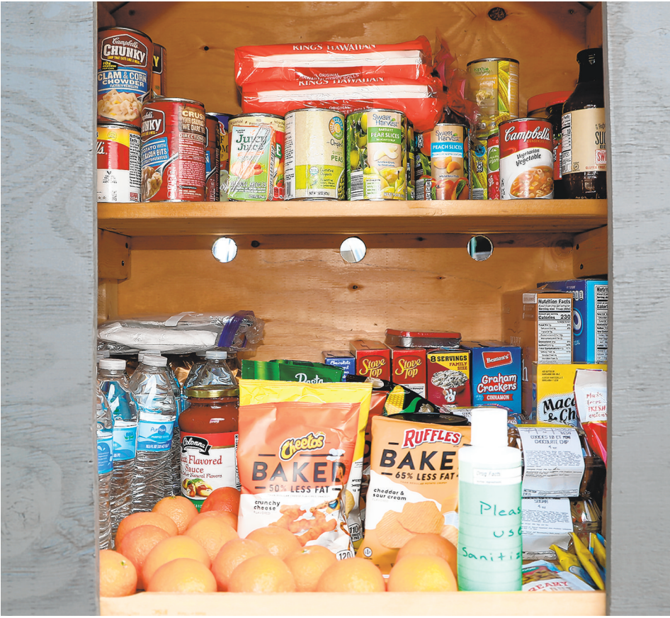
INSIDE OF a help-yourself food pantry created by Huntington Beach resident "Mac" Bishop.