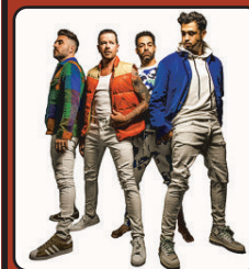
SUN, NOV 20 O-TOWN