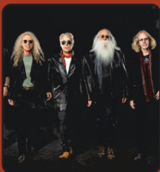
THU, DEC 8 IMMEDIATE FAMILY