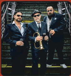
FRI, NOV 18 FUN LOVIN' CRIMINALS