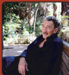
SUN, DEC 4 FEE WAYBILL