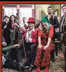
TUE, DEC 13 SQUIRREL NUT ZIPPERS