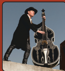
FRI, NOV 25 LEE ROCKER of The Stray Cats