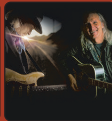
THU, NOV 17 DAVE ALVIN JIMMIE DALE GILMORE