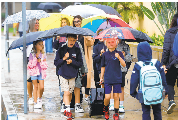
KIDS ACCOMPANIED by their parents arrive in the rain on the first day of school at Newport Coast Elementary.

Over the weekend there had been questions of whether or not classes would be held Monday as Hurricane Hilary swept through Southern California. But on Sunday, the district announced to parents and staff that plans to open were on track.