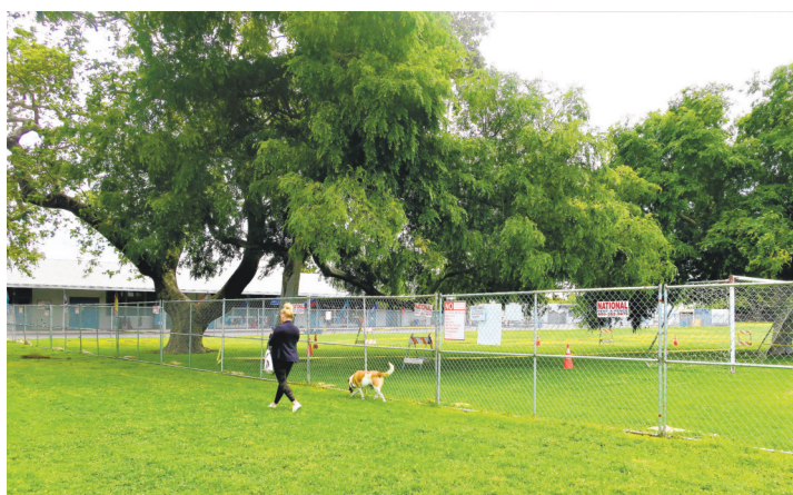
A WOMAN walks her dog Thursday at Harper Park, where a field belonging to Newport-Mesa Unified was recently fenced off.