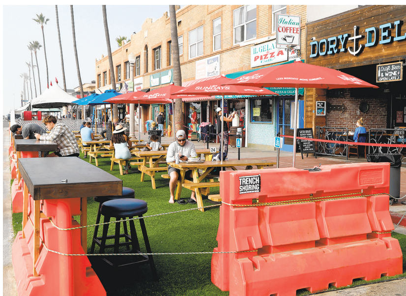
DINERS sit in an outdoor dining area by Dory Deli at Newport Beach Pier on Tuesday.