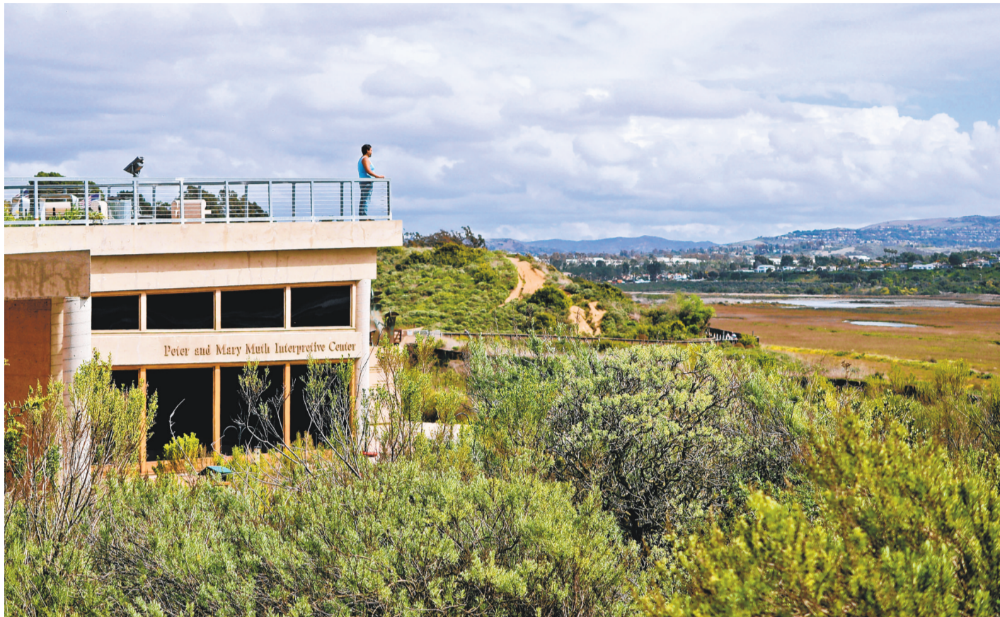
A VISITOR LOOKS OUT over the Upper Newport Bay State Marine Conservation Area from the observation deck at the Peter and Mary Muth Interpretive Center in Newport Beach March 10. The interpretive center is currently closed, but the park is open to visitors.