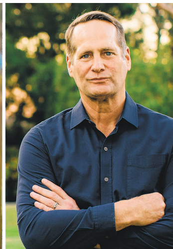
U.S. REP.-ELECT Michelle Steel, the Orange County Board of Supervisor chair, and outgoing Rep. Harley Rouda, who lost his bid for reelection to Congress, representing the 48th District, which covers coastal Orange County.