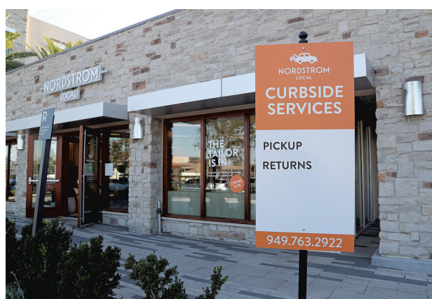
A NEW NORDSTROM Local service hub offers curbside services in Newport Beach. It opened Friday.

These services are also available at Nordstrom full-line stores, but Mattingly