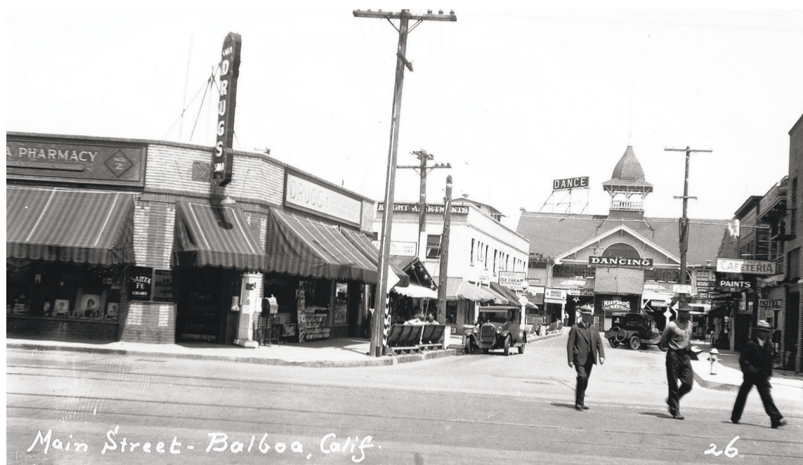
Main Street - Balboa, Calif.