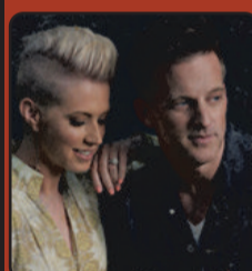
SUN, SEP 5 THOMPSON SQUARE