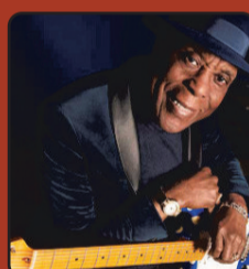
WED, SEP 8 BUDDY GUY