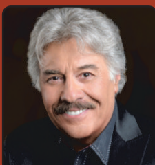
WED, SEP 1 TONY ORLANDO