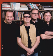
SAT, AUG 21 THE SMITHEREENS