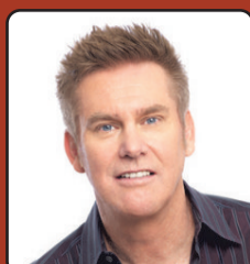
WED, AUG 25 BRIAN REGAN