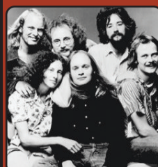
FRI, AUG 13 HONK