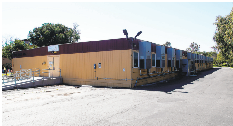
THE AREA for the Mesa Court residence housing expansion at UC Irvine.

The new housing will be located on the north end of campus, off of Campus Drive near University Drive. It will provide about