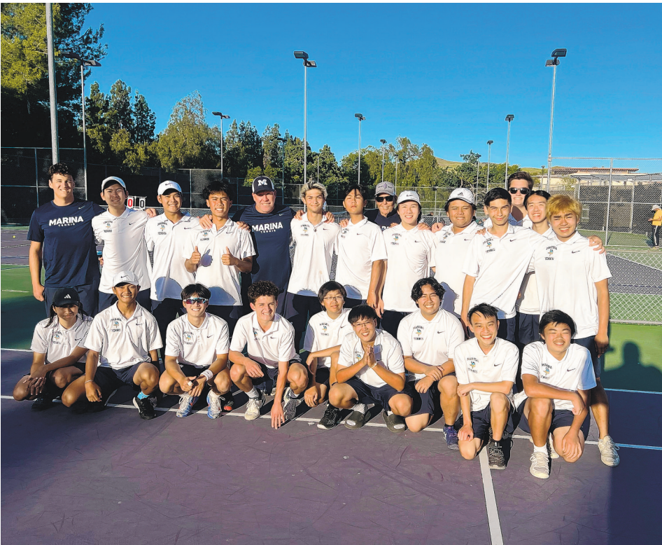
THE MARINA HIGH boys' tennis team is all smiles after winning 11-7 at Oak Park on Wednesday afternoon. The Vikings will play Woodbridge for the CIF Southern Section Division 1 title on Friday evening at the University of Redlands.