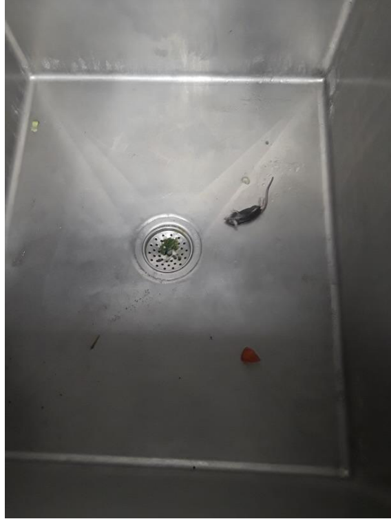
Apparent dead rat in sink of first floor kitchen on October 12, 2023