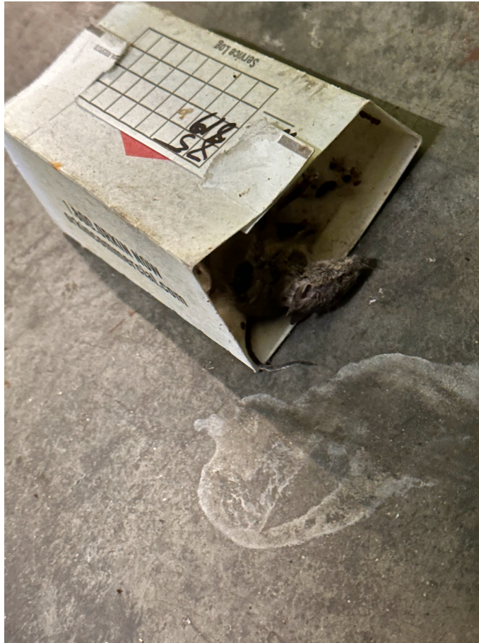
Apparent dead rat in box found on storage room floor on May 3, 2023