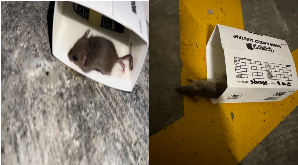
Left is live rat and right is rat that appears to be dead; both taken on July 31, 2023

That same day, July 31, 2023, the Department of Public Health posted a notice of closure on the storage room door because of vermin infestation and vermin harborage. A photo of the notice is provided below: