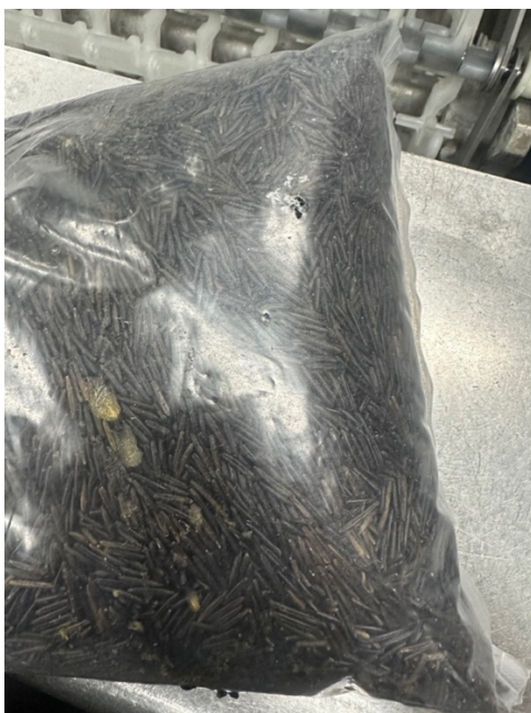
Black rice bag with apparent rat pee, feces, and bites found on August 9, 2023

On or around August 9, 2023, an employee found a bag of black rice in the storage room covered with what appeared to be rat feces, pee, and bite marks. He took a photo and video of the bag with apparent rat waste and bite marks. The photo is provided below, and the video is filed as Exhibit D . The employee also sent the photo through 7shifts to the supervisor on duty. The supervisor instructed the employee to throw away the bag of black rice.