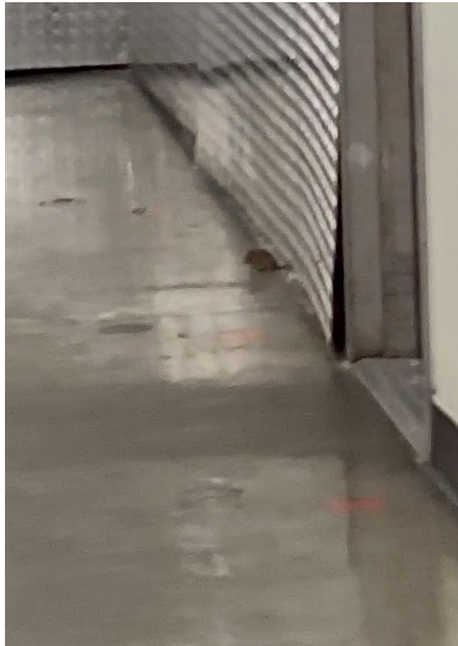
Rat in the hallway near the storage room on the evening of May 20, 2023

view, and he showed that video to the chef on duty. The video is attached as Exhibit A , and a screengrab from the video is provided below: