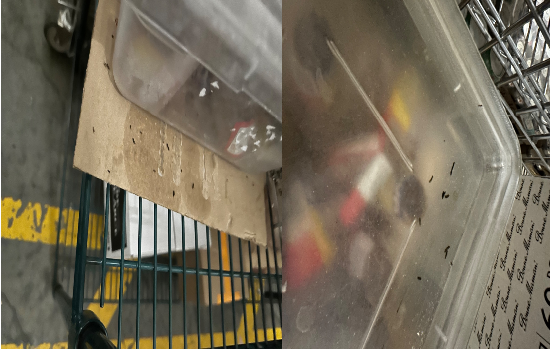
Apparent rat feces on top of containers in storage room on July 28, 2023

On or around July 29, 2023, the Company closed the restaurant early to install sticky traps to eliminate the rats. But as detailed below, the rats continued to appear.