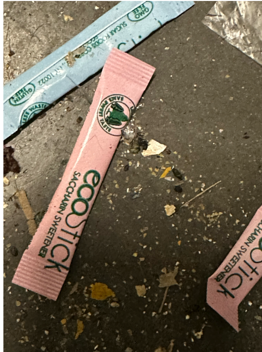
Apparent rat feces on floor of storage room on August 29, 2023

managers told the employee in person that they were in communication with an extermination company.