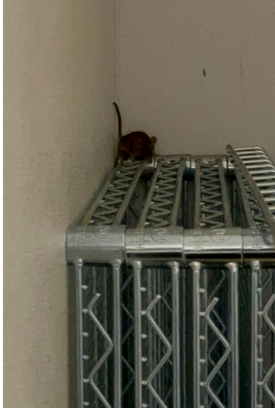
Photo of what appeared to be a rat in storage room on July 14, 2023

On or around July 28, 2023, an employee observed what appeared to be rat feces on containers located in the storage room. He reported this sighting to Chef Jennifer and took two pictures. The two photos of the apparent rat feces are provided below: