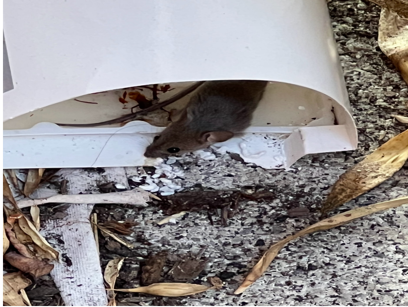
Mouse stuck on trap found inside the restaurant on July 30, 2023

And in the afternoon of July 30, 2023, a guest at the restaurant got their foot stuck on a glue trap that the Company placed under a dining table. This same afternoon, the Company instructed an employee to set traps in the storage room. The Company also instructed the employee to routinely clean the storage room. However, as shown below, the rat traps and cleaning failed to resolve the rodent infestation.