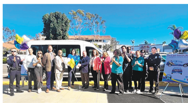
COSTA MESA officials celebrate the launch of Let's Go Costa Mesa, which brings residents from the west side and College Park neighborhood to shopping destinations in and around the city's East 17th Street corridor.