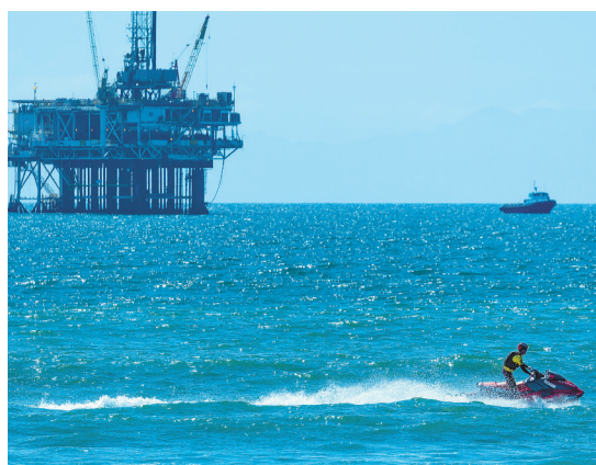
A JETSKI rides the water near Huntington Dog Beach, where tar balls and debris were found at the high-tide line on Friday.