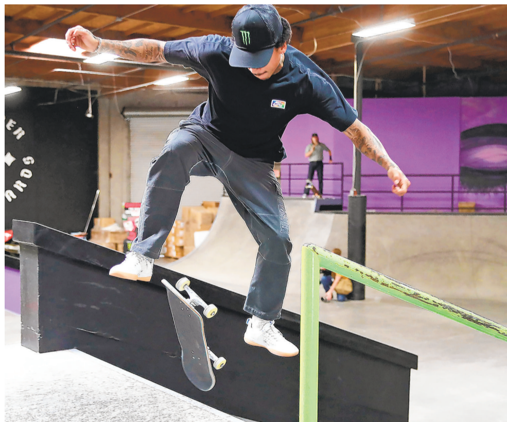
PRO SKATEBOARDER Nyjah Huston practices at his skate park in San Clemente.