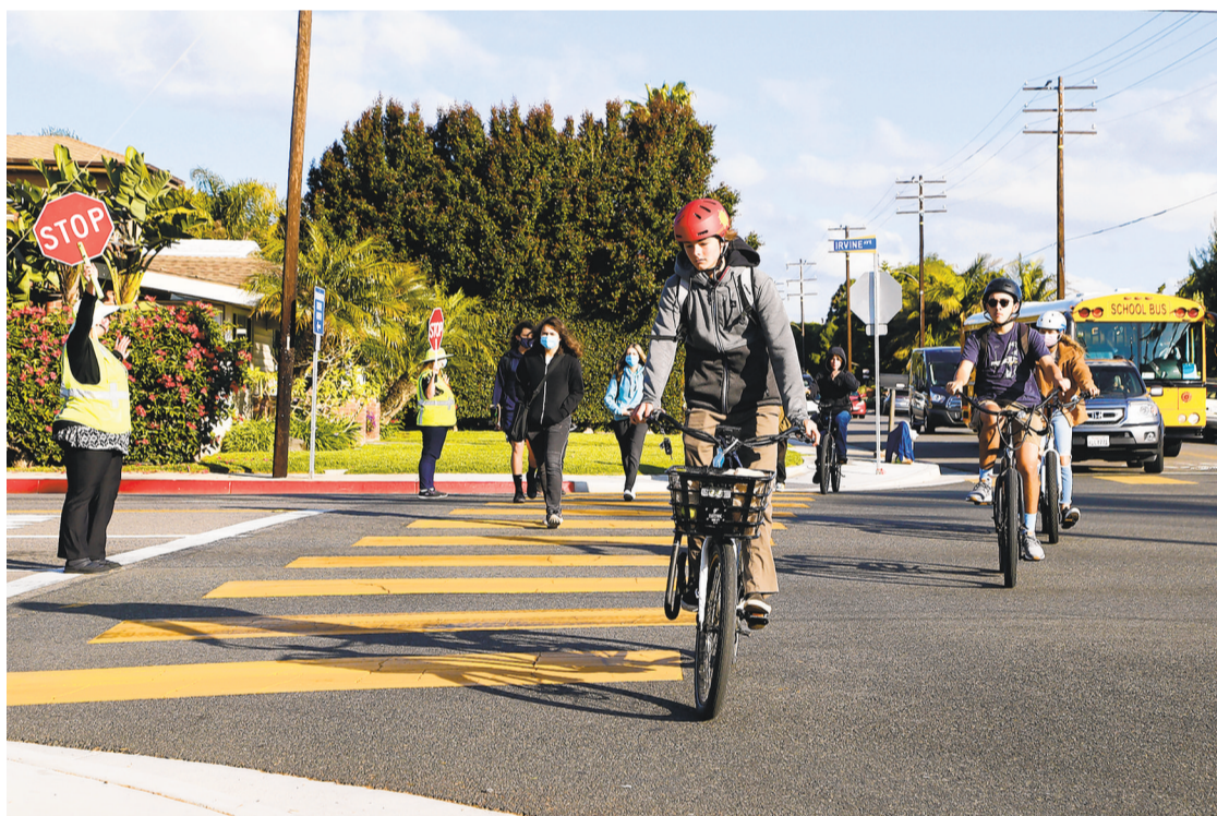
ABOVE: Students cross Irvine Avenue along 16th Street as they return to campus for full-day learning at Newport Harbor High on Tuesday.