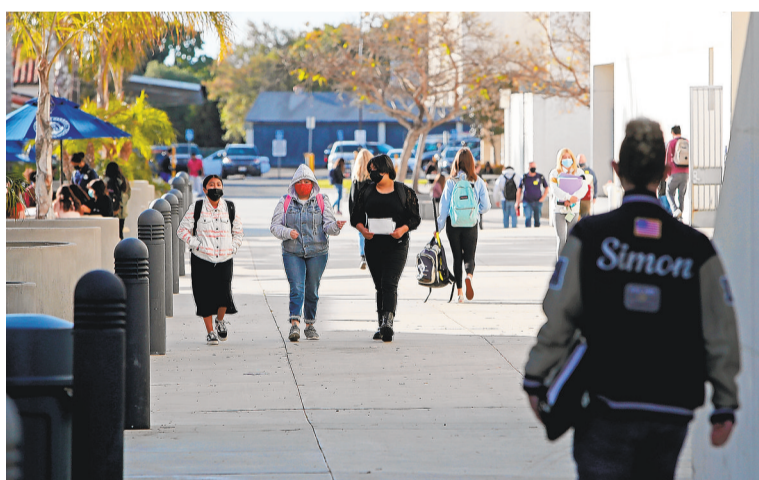
LEFT Newport-Mesa secondary students will be returning to classrooms four days a week with one day for remote learning.