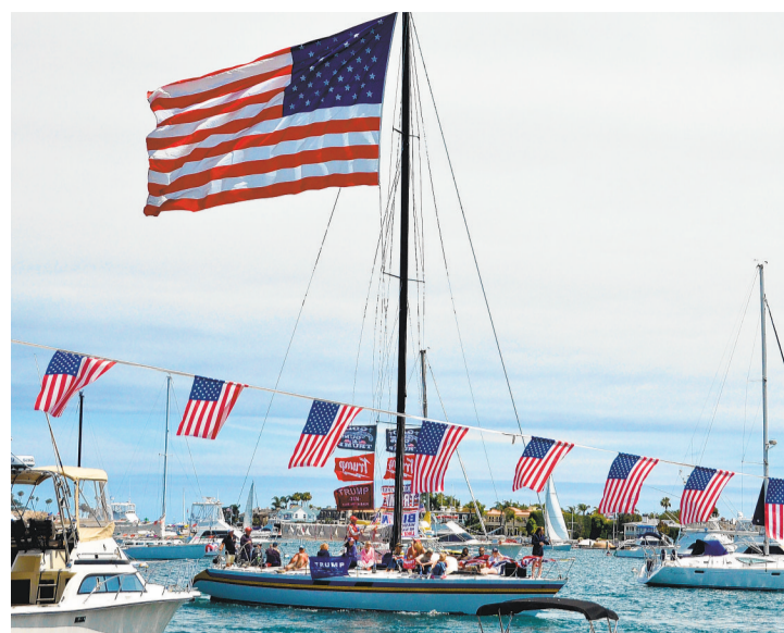
A LARGE SAILBOAT bearing a huge American flag navigated the narrow waterway among the moored boats in Newport Harbor.