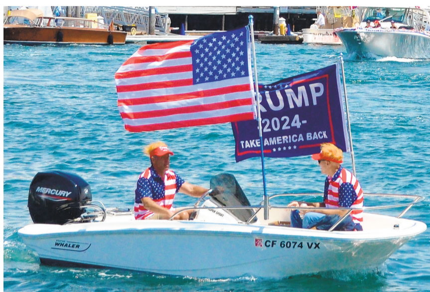
TWO CARROT-TOP SAILORS , their hairstyles inspired by Donald Trump, cruise in a Boston Whaler in the Trumptilla boat parade.