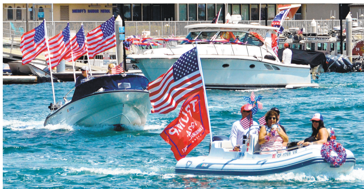
BOATS OF ALL sizes were part of the Trumptilla parade of more than 100 boats Sunday in Newport Harbor.