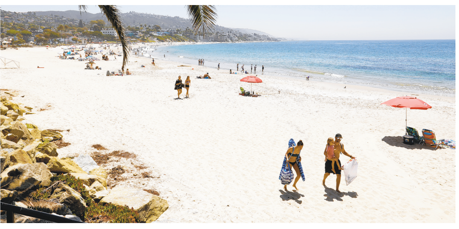
THE CITY OF Laguna Beach has posted signs that read, "You must wear a face covering. It's the law," but not everyone is on board.

"Our national political leadership has undermined its experts,