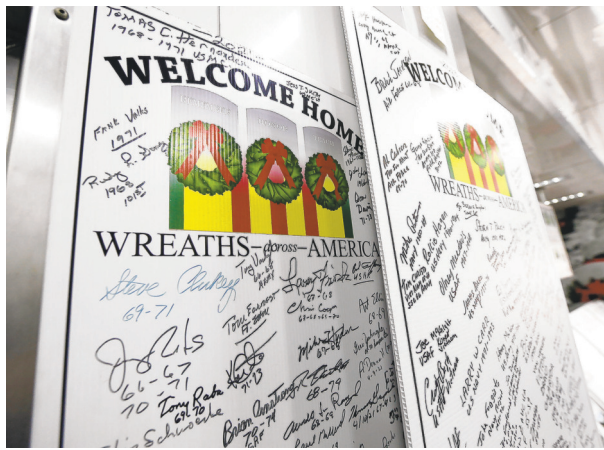
SIGNATURES FROM Vietnam veterans can be seen on posters as part of the traveling exhibition.