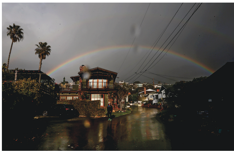
A FULL rainbow appears in a beam of sunlight as a rain storm flurry passes overhead on Lombardy Street in Laguna Beach last week.