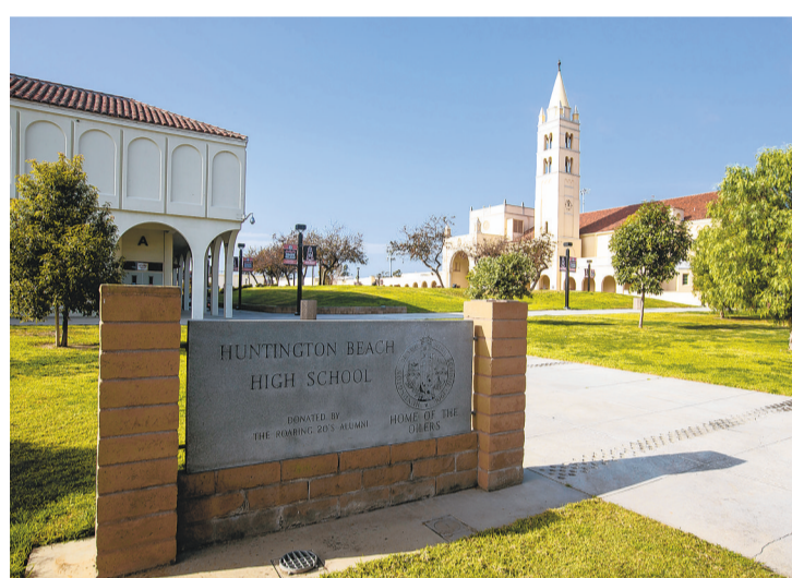
HUNTINGTON BEACH Union High School District is among other local school districts that are returning to distance learning.

sara.cardine@latimes.com Twitter: @SaraCardine