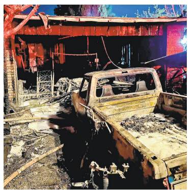
Costa Mesa Fire and Rescue

With assistance from Newport Beach Fire Department, crews extinguished the blaze in about 45 minutes but remained on scene much longer to completely overhaul the area and ensure no embers remained in the structure, which Coates said had a lot of contents inside.