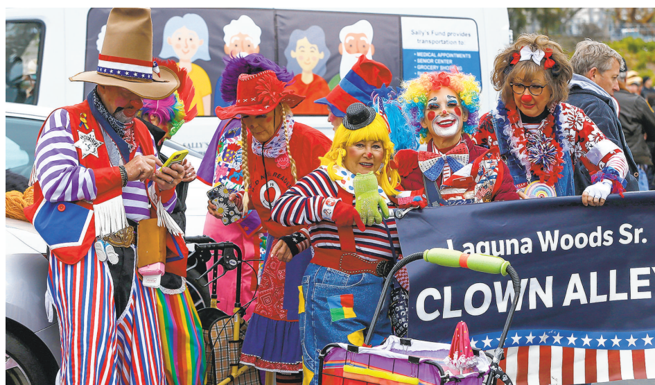
BELOW: Members of the colorful Laguna Woods Clown Alley crew prepare for the 56th annual Patriots Day Parade.