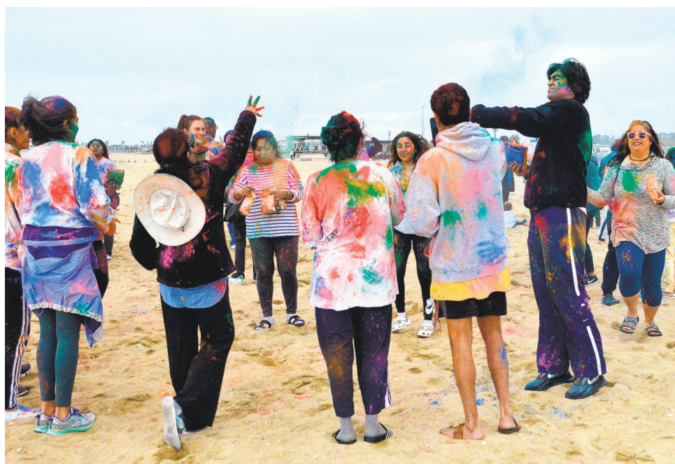
ATTENDEES OF CRY America's "Holi by the Sea" event, held Sunday at Bolsa Chica State Beach, frolicked on the sand tossing packets of color at each other.