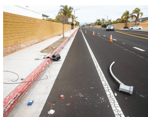
DEBRIS litter the street after a police chase ended in a crash on Yorktown Avenue.

A suspect who suffered minor injuries was arrested at the scene of the crash, Cuchilla said. Another tried to escape into the surrounding neigh-