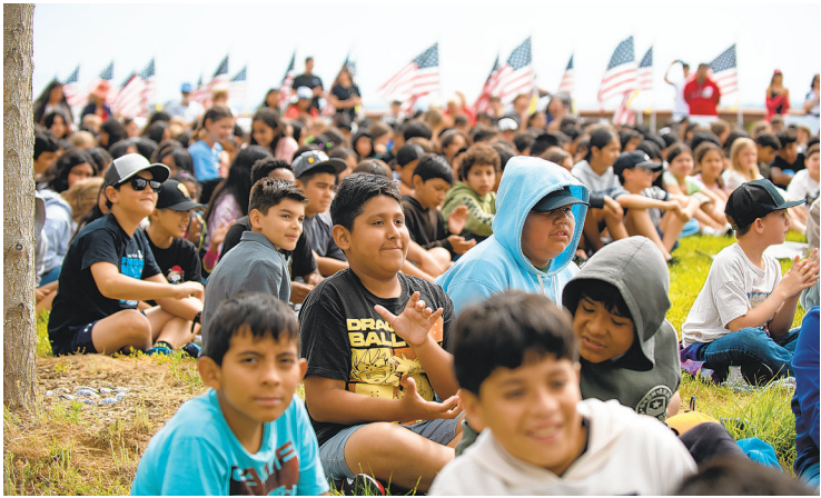
FIFTH GRADERS applaud during a presentation Thursday at the Field of Honor celebration at Castaways Park.