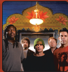
WED, JAN 20 COMMON SENSE