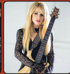
THU, JAN 26 ORIANTHI