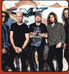
THU, DEC 29 Jack Russell's GREAT WHITE