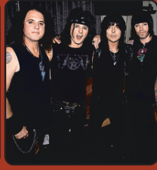
FRI, DEC 30 L.A. GUNS