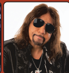
THU, FEB 23 ACE FREHLEY