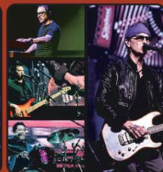
THU, FEB 9 BODEANS