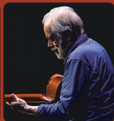
WED, FEB 8 LEO KOTTKE