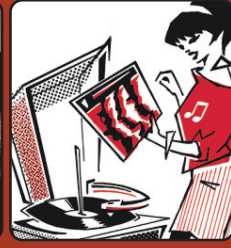
DEC 31 & JAN 1 THE ENGLISH BEAT