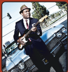
SAT, JAN 28 ROBERT CRAY