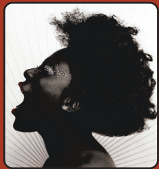
TUE, JAN 19 MACY GRAY