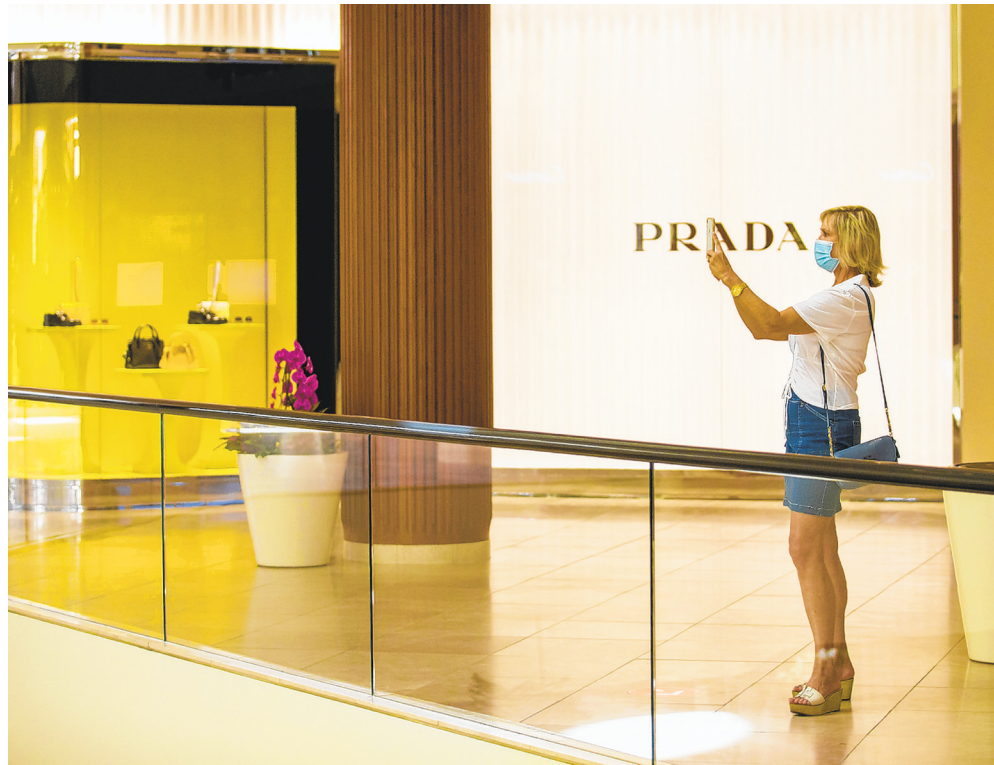
See Plaza , page A2

Mall officials, employees and those who know what South Coast Plaza's sales tax revenues mean for the city's own financial picture were no less joyful about the grand-reopening, which will see the return of more than 100 boutique storefronts this week, followed