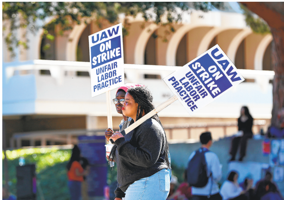
TWO UCI STUDENTS walk Monday morning in support of unionized academic workers across the University of California system. It's being called the largest strike in higher education history.