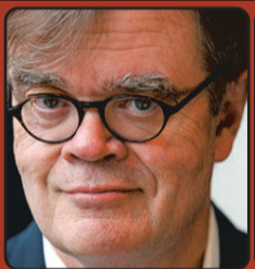
SAT, SEP 30 GARRISON KEILLOR