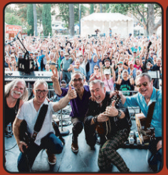
SAT, SEP 16 THE FENIANS