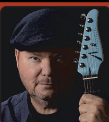
WED, OCT 25 CHRISTOPHER CROSS

ticketweb 866.468.3399 | 33157 Camino Capistrano | San Juan Capistrano Like Us on facebook.com/coachhouseconcerthall | follow us on Twitter @coach_house