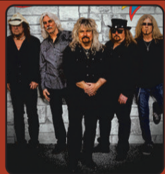
SUN, SEP 24 MOLLY HATCHET