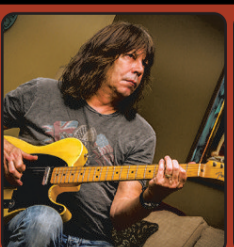
THU, OCT 19 PAT TRAVERS