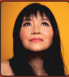
THU, SEP 21 KEIKO MATSUI