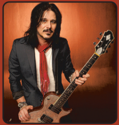
FRI, SEP 1 GILBY CLARKE