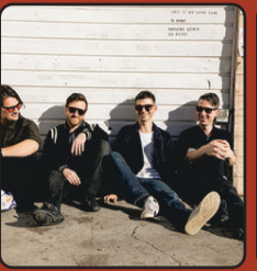
WED, SEP 20 PHANTOM PLANET