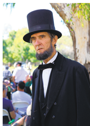
AN ACTOR portraying Abraham Lincoln cheers on the Union army at the Civil War Days in 2019.