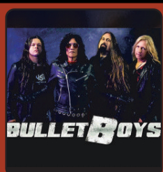
FRI, OCT 6 BULLET BOYS