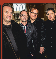
SAT, MAR 11 THE SMITHEREENS