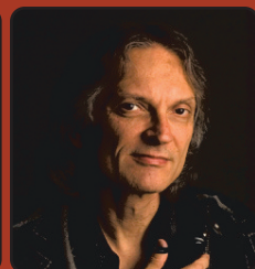
SUN, MAR 5 SONNY LANDRETH