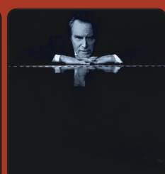
FRI, MAR 10 JD SOUTHER