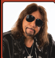
THU, FEB 23 ACE FREHLEY