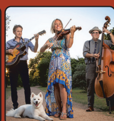
THU, MAR 16 HOT CLUB OF COWTOWN