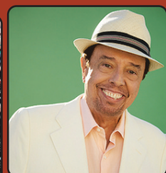
SAT, MAR 18 SERGIO MENDES