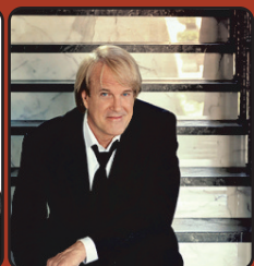
FRI, FEB 24 JOHN TESH