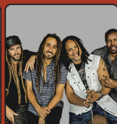
SUN, MAR 26 BIG MOUNTAIN

ticketweb 866.468.3399 33157 Camino Capistrano | San Juan Capistrano Like Us on facebook.com/coachhouseconcerthall | follow us on Twitter @coach_house