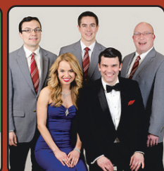
SUN, MAR 19 GLENN MILLER ORCHESTRA