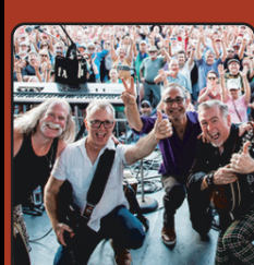
FRI, MAR 17 FENIANS