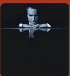
FRI, OCT 8 JD SOUTHER