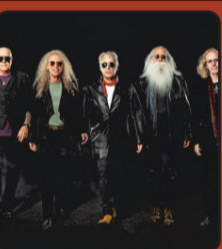
WED, NOV 3 THE IMMEDIATE FAMILY