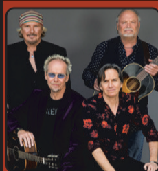
FRI, OCT 1 VENICE