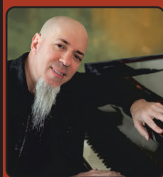
THU, SEP 9 JORDAN RUDESS