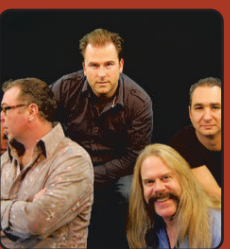
SAT, SEP 25 THE FENIANS