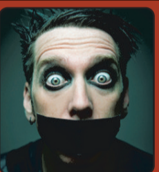
SAT, OCT 16 TAPE FACE