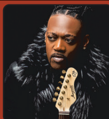
WED, AUG 2 ERIC GALES