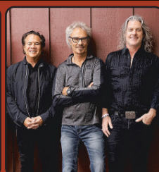
FRI, AUG 4 PABLO CRUISE