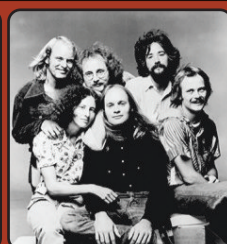
SAT, AUG 5 HONK