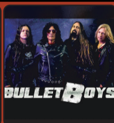
FRI, OCT 6 BULLET BOYS

10/14 DESPERADO (EAGLES TRIBUTE) 10/15 JOURNEYMAN (ERIC CLAPTON TRIBUTE) 10/18 FUNNIEST HOUSEWIVES (COMEDY SHOW) 10/19 PAT TRAVERS BAND 10/27 PIANO MEN (BILLY JOEL AND ELTON JOHN TRIBUTE) 10/29 MARTIN SEXTON 10/31 OINGO BOINGO FORMER MEMBERS 11/1 RIDERS IN THE SKY (ACOUSTIC WESTERN COWBOY MUSIC AND HUMOR) 11/2 ZEBRA 11/3 LED ZEPAGAIN (LED ZEPPELIN TRIBUTE) 11/4 LED ZEPAGAIN (LED ZEPPELIN TRIBUTE) 11/5 BEN OTTEWELL / IAN BALL 11/8 RODNEY CROWELL 11/9 THE YOUNG DUBLINERS 11/10 WHICH ONE'S PINK? "WISH YOU WERE HERE" 11/11 WHICH ONE'S PINK? "DARK SIDE OF THE MOON" 11/12 WISHBONE ASH 11/15 LEONID & FRIENDS (CHICAGO TRIBUTE) 11/16 LEONID & FRIENDS (CHICAGO TRIBUTE) 11/18 ABBAFAB (ABBA TRIBUTE) 11/19 COCO MONTOYA 11/22 QRST (QUEEN/RUSH/STYX TRIBUTE) 11/26 ARETHA STARRING CHARITY LOCKHART 11/30 THE MUSICAL BOX - SELLING ENGLAND BY THE POUND 12/1 THE MUSICAL BOX - SELLING ENGLAND BY THE POUND 12/2 LEE ROCKER OF THE STRAY CATS 12/8 GENE LOVES JEZEBEL / BOW WOW WOW 12/16 GARY HOEY'S ROCKIN HOLIDAY SHOW 12/22 AMBROSIA: A VERY SPECIAL HOLIDAY SHOW