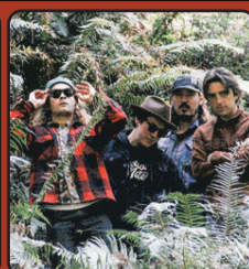
SUN, AUG 6 MICHIGAN RATTLETS

7/28 SPACE ODDITY (DAVID BOWIE TRIBUTE) 7/29 KIDS OF CHARLEMAGNE (STEELY DAN TRIBUTE)