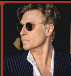
FRI, SEP 29 JOHN WAITE