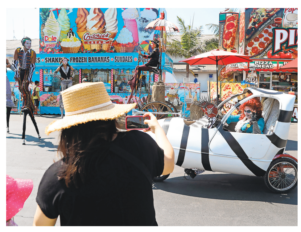
A MEMBER of the Dragon Knights smiles for a photo during opening day on Friday.

ily wanted to get in one last hurrah before the newlyweds moved out of state.