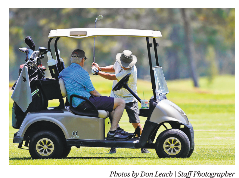
GOLFERS PLAY a round at Mile Square Park's Classic course on Friday.