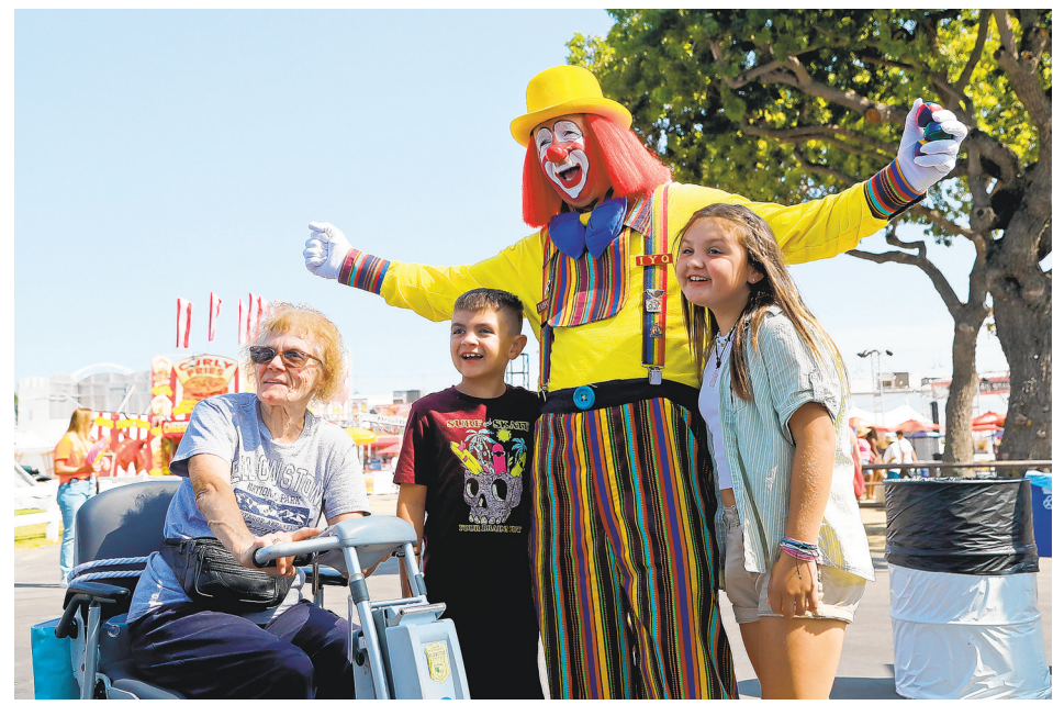
FAIR CLOWN Iyq poses for photos with fairgoers as they enter the main entrance Friday.