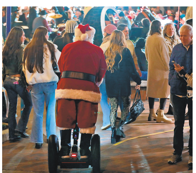
A SANTA CLAUS moves through the crowd on Forest Avenue on a people mover device during Hospitality Night in downtown Laguna Beach..