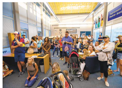
PARENTS AND children wait outside the Newport-Mesa school district boardroom.