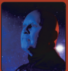
SAT, DEC 23 FLOCK OF SEAGULLS