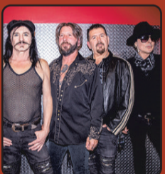
THU, DEC 28 L.A. GUNS