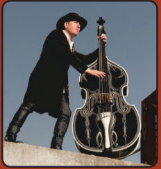
SAT, DEC 2 LEE ROCKER of The Stray Cats