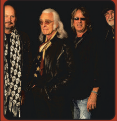
FRI, NOV 17 FOGHAT