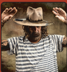
DEC 29 & 30 DONAVON FRANKENREITER