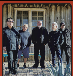
SUN, DEC 31 LOS LOBOS New Year's Eve