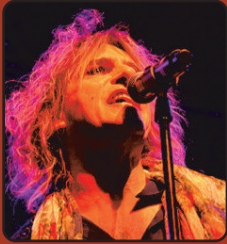
FRI, DEC 8 GENE LOVES JEZEBEL