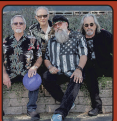
THU, JAN 11 CANNED HEAT