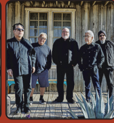
SUN, DEC 31 LOS LOBOS New Year's Eve