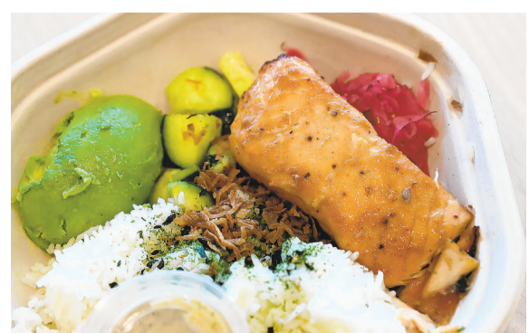
THE MISO glazed salmon plate at the new Sweetgreen location in Huntington Beach.