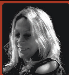
TUE, FEB 6 RICKIE LEE JONES