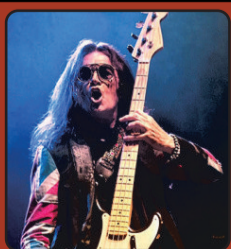
SAT, FEB 3 GLENN HUGHES