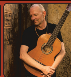
WED, FEB 14 OTTMAR LIEBERT