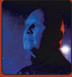
SAT, DEC 23 FLOCK OF SEAGULLS