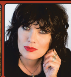
SAT, FEB 17 THE MOTELS

ticketweb 866.468.3399 | 33157 Camino Capistrano | San Juan Capistrano Like Us on facebook.com/coachhouseconcerthall | follow us on Twitter @coach_house