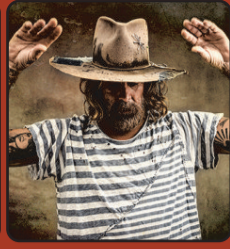
DEC 29 & 30 DONAVON FRANKENREITER