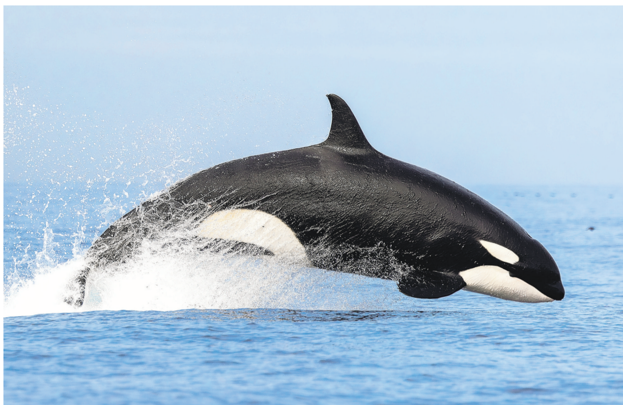
Delaney Trowbridge | Newport Coastal Adventure

"We subsequently launched two of our boats