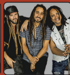
SUN, JAN 21 BIG MOUNTAIN