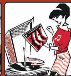
FRI, FEB 2 ENGLISH BEAT