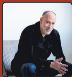
JAN 19 & JAN 20 MARC COHN