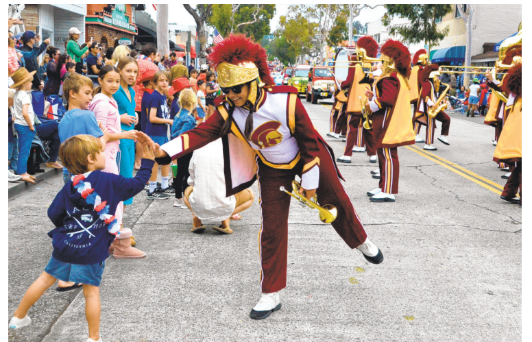
A MEMBER of the USC Trojan marching band greets kids on Sunday.