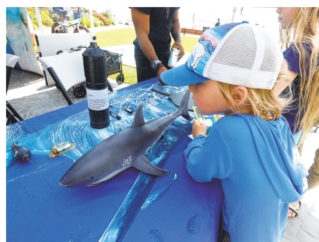
A YOUNGSTER eyes a toy shark at an educational display Saturday during KelpFest, an annual ocean awareness event held at Laguna Beach's Main Beach.

It was intended to celebrate a years-long effort by local environmental groups and residents working together to restore Laguna