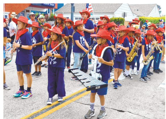
THE MARINERS Elementary School Band, the Mighty Marlins, performs during the Balboa Island Parade on Sunday.