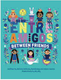
ILLUSTRATIONS © ELY ELY FROM "ENTRE AMIGOS" PUBLISHED BY LA JOYA PRESS