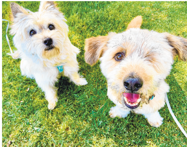
See Dog , page A5 TERRIER-MIX Hobie, right, with sister Zoe, a 15-year-old Cairn terrier.

The pooch was safely picked up and transported to the shelter in Laguna Beach under the aegis of an anonymous Laguna Beach resident who regularly sends supplies to the border and works