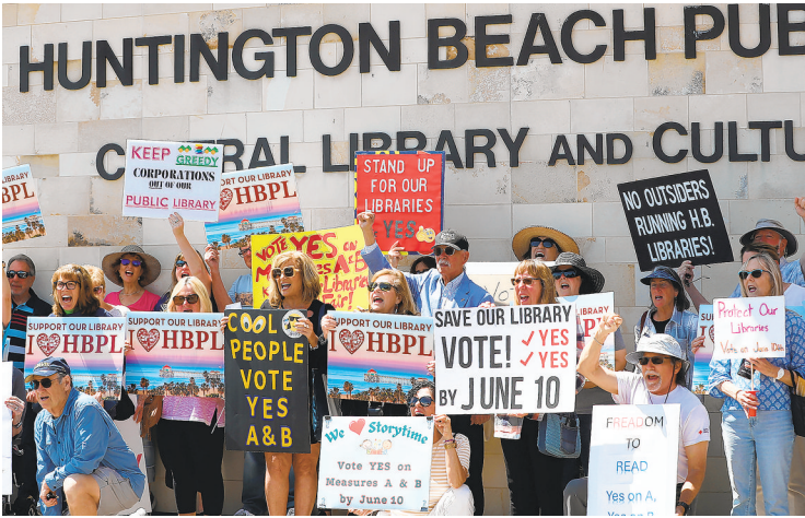
SUPPORTERS OF Our Library Matters take a group picture during a press conference at Huntington Beach Central Library on Tuesday.