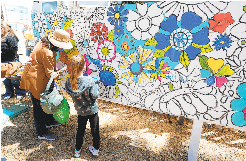
A CHILD PAINTS a flower mural at the Spring Fling event at the Sawdust Art Festival in Laguna Beach.